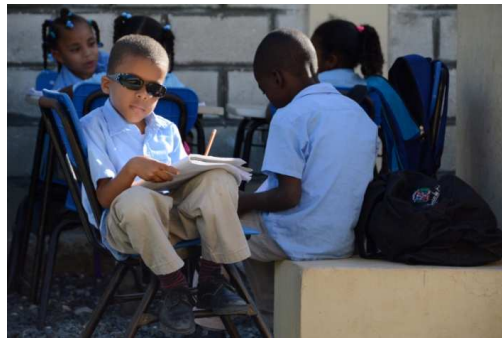
Élève au travail avec ses nouvelles solaires Student at work with his new sunglasses