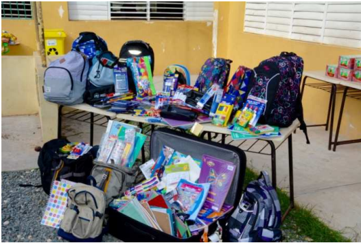
Articles scolaires School supplies