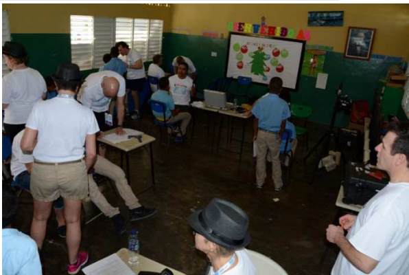
La clinique visuelle en action The clinic in action