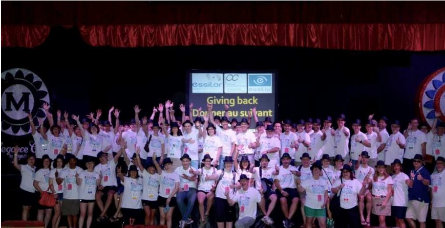
Équipe des bénévoles Essilor The Essilor volunteers