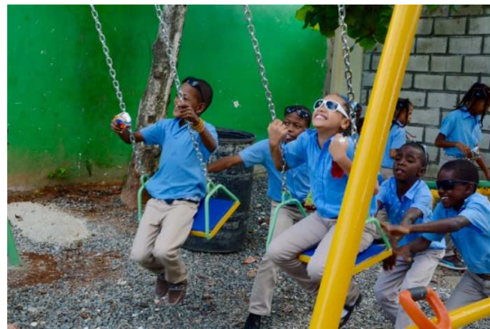
Au jeu dans la nouvelle cours d'école Playing with the new equipment