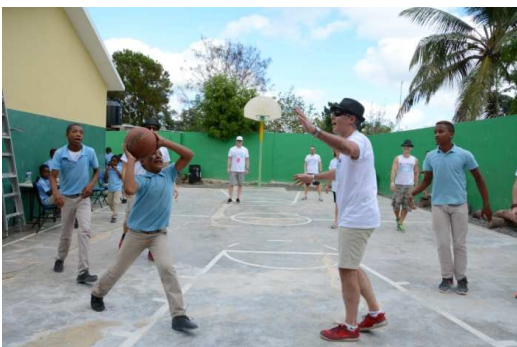
Au jeu dans la nouvelle cours d'école Playing with the new equipment