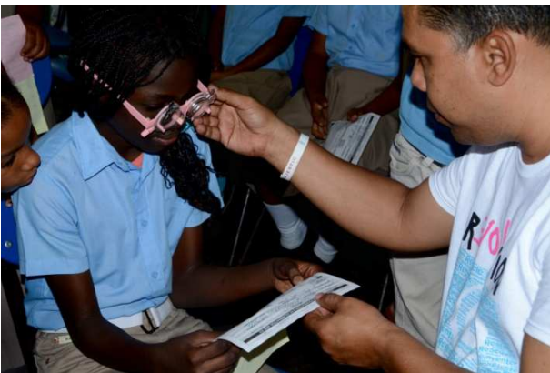
Optométriste Dominicain à l'œuvre Dominican optometrist at work