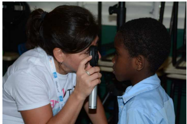
Optométriste canadienne à l'œuvre Canadian optometrist at work