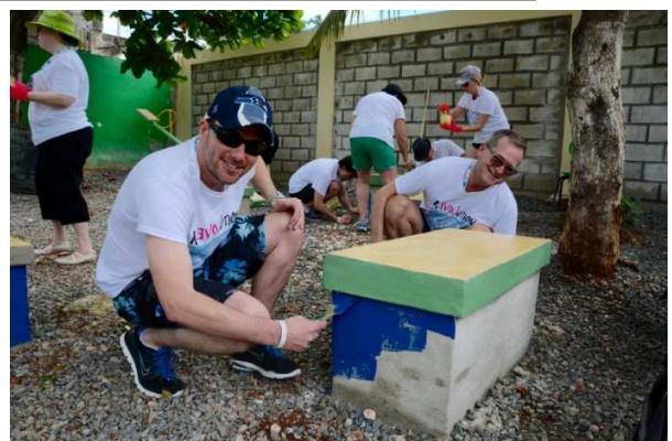
Cure d'embellissement pour une cours d'école Beautifying the school yard