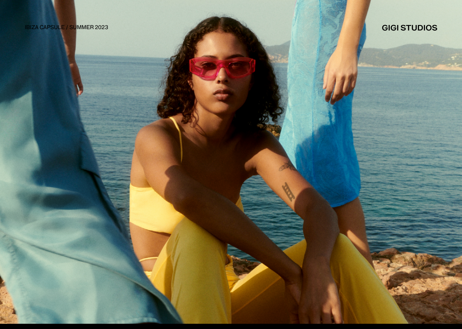
RAY 6825 / 6