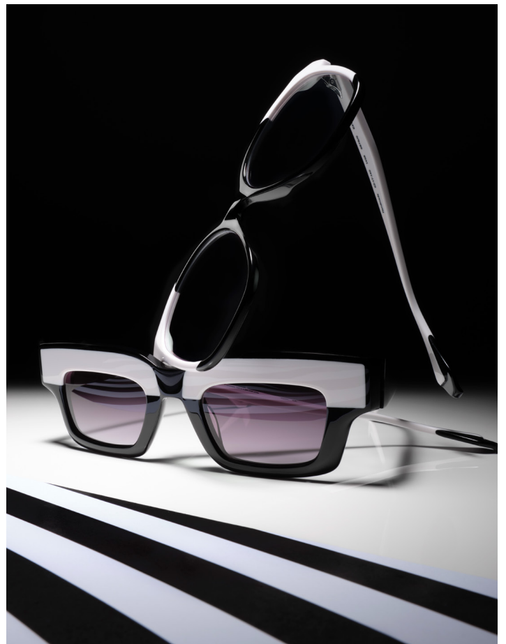
CONTRAST 6875/9 & EXTREME 6878/0